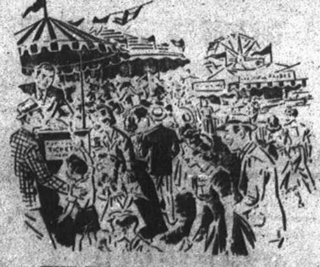
THE GIGANTIC MIDWAY

Bringing To Your Door Many Wonders Of The WORLD