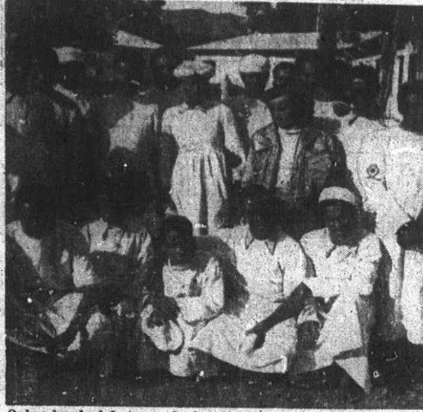
Only a hundred doctors and a few dozen nurses were available until recently to care for Ethiopia's total population of some 12,000,000. Now, with the aid of the U.N. World Health Organization (WHO), training programs in all parts of the country are turning out the necessary help to relieve the critical shortage of medical personnel.

All of the glass in a Fisher Body is safety-plate, which not only is an important safety factor but provides more enjoyment through better vision for passengers.