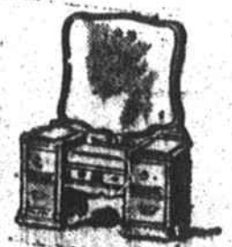
Poster Bed, Wardrobe Vanity and Bench Reg. $399.50 value