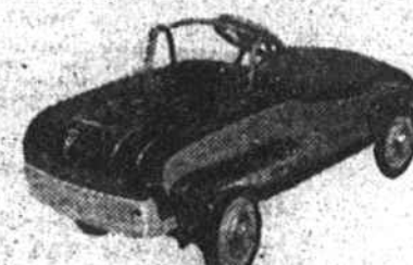
AUTOS Station Wagons Fire Trucks