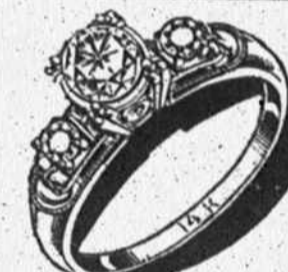
3-DIAMOND RING Fine 14K gold "fishtail" setting. $50.00 $1.25 Weekly