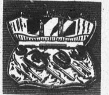
6-piece Dresser Ensemble. $9.95 50¢ A Week