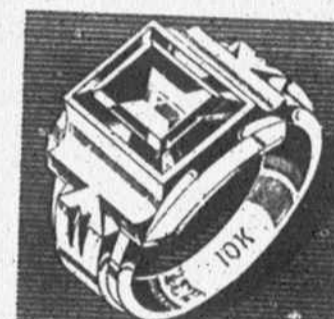
Birthstone Ring, 10K gold mounting. $17.50 50¢ A Week