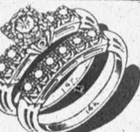
16-DIAMOND DUETTE Matched 14K gold mountings. $189.50 $2.25 Weekly