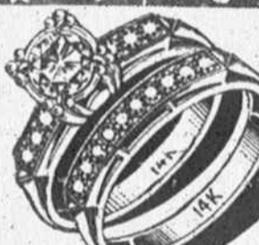
19-DIAMOND DUETTE Fine, clear cut diamonds. $275 Easy Terms