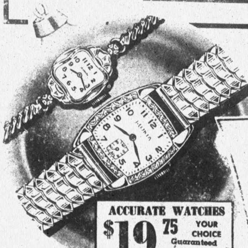
ACCURATE WATCHES $19.75 YOUR CHOICE Guaranteed 50¢ A WEEK

Dellinger's Jewel Shop Kings Mountain's Leading Jewelers