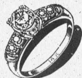
5-DIAMOND RING A blaze of fiery diamonds. $90.00 $1.25 Weekly