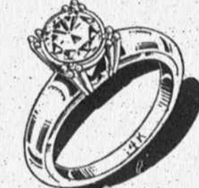
DIAMOND SOLITAIRE Tailored 14K gold mounting. $37.50 $1.00 Weekly