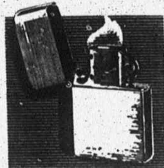
Cigarette Lighters 88c