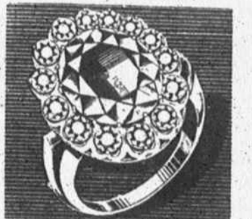
Birthstone and Diamond Cluster Ring. $39.75 $2 a Week