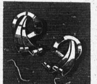
Smart new earring styles. Choice $1.25 Charge It