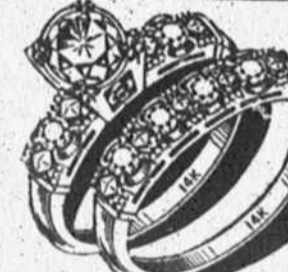
7-DIAMOND DUETTE Gleaming 14K gold mountings. $115.00 $1.50 Weekly