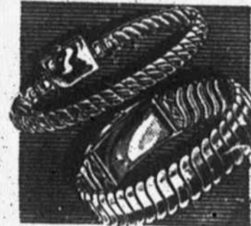
Ladies & Gents Expansion Watch Bracelets $2.88