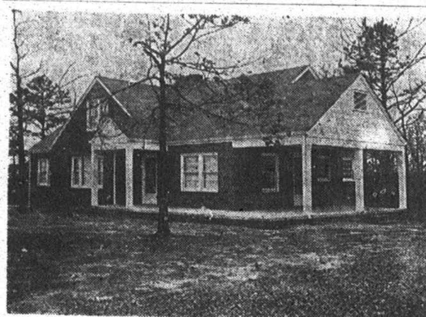
DEDICATION SUNDAY — Recently completed Bethlehem Baptist church parsonage will be dedicated at special dedicatory services Sunday afternoon at 2:30. The project was begun less than a year ago.