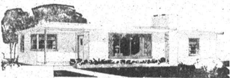
A SMALL HOUSE PLANNING BUREAU DESIGN NO. A-269