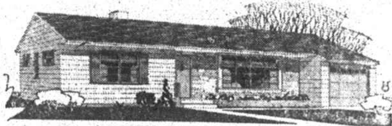
A SMALL HOUSE PLANNING BUREAU DESIGN NO. B-271