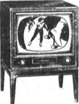
21-inch Bentley. Family-sized, 21-inch television in a cabinet finished in grained mahogany, grained blond, extra. Matching stand available at extra cost. Model 21T356U. $339.50