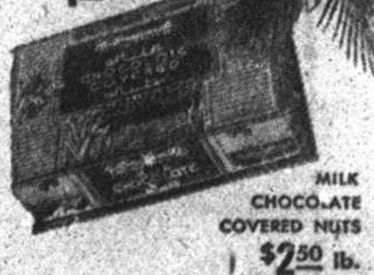
MILK CHOCOLATE COVERED NUTS $2.50 lb.