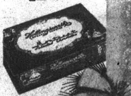
THE MONTREAT $1.75 lb.