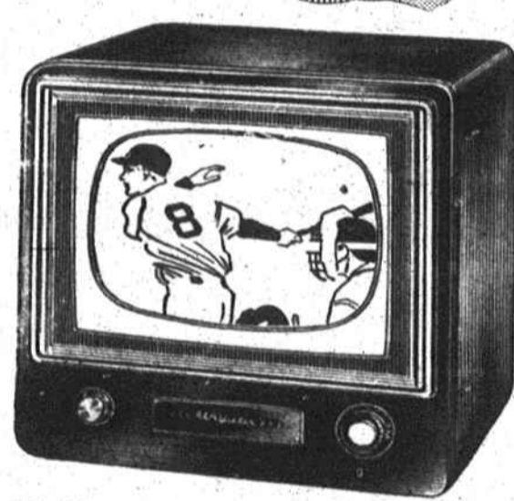
17-inch Hayes. The space-saver Hayes is just the answer when you want compactness and beauty. Contemporary cabinet is finished in grained mahogany, grained blond, extra. Model 17T352U.