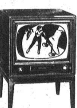
21-inch Bentley. Family-sized, 21-inch television in a cabinet finished in grained mahogany, grained blond, extra. Matching stand available at extra cost. Model 21T354U.