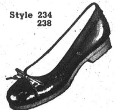
Style 234 238