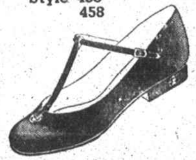
Style 456 458

After the meeting, a social hour was enjoyed and hostesses for the meeting served cold drinks and cookies.