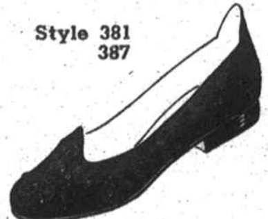
Style 381 387