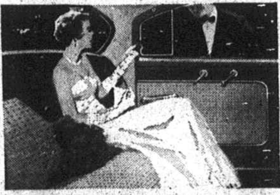
FINE-CAR SIZE AND LUXURY —Here is the key to Pontiac's great distinction, superior comfort and remarkable roadability. Pontiac is fully as big and luxurious as top-priced cars!