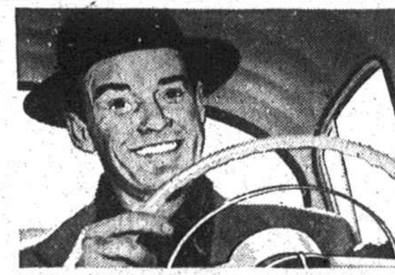
FINE-CAR DRIVING CONVENIENCES —Pontiac provides every fine-car option—Dual-Range Hydromatic Drive, Power Brakes, Power Steering, Comfort-Control Seat—at very low extra cost.