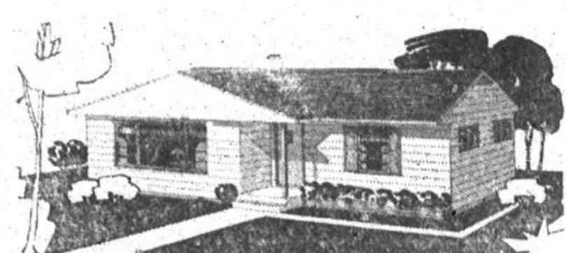
A SMALL HOUSE PLANNING BUREAU DESIGN NO. B-318