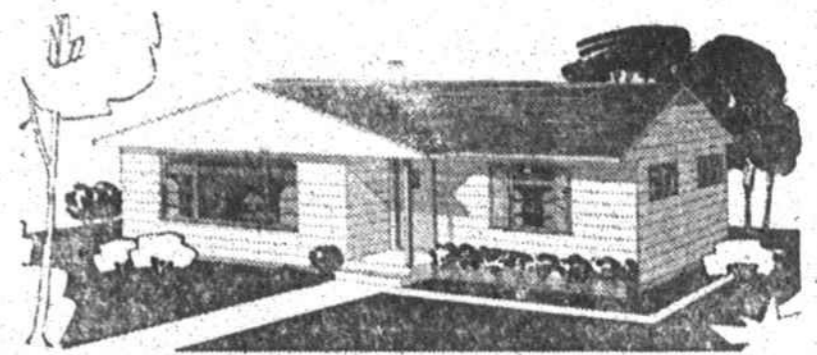
A SMALL HOUSE PLANNING BUREAU DESIGN NO. B-318