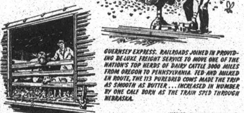
GUANSEY EXPRESS. RAILROADS JOINED IN PROVIDING DE LUXE FREIGHT SERVICE TO MOVE ONE OF THE NATION'S TOP BREEDERS OF DAIRY CATTLE 3000 MILES FROM OREGON TO PENNSYLVANIA. TED AND ALMED EA ROUTE, THE 113 PUREBRED COWS MADE THE TRIP AS SMOOTH AS BUTTER... INCREASED IN NUMBER BY ONE CALF BORN AS THE TRAIN SPED THROUGH NEBRASKA.