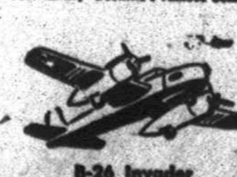
B-26 Invader Wholly Used in Recent Korean Conflict

There's a lot of fun about building Monogram kits and your models. Easy enough for the young beginner—inspiring enough to interest dad. Kits are complete and include fully shaped tails and bodies.