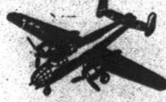
B-25 Mitchell Gen. "Henry" Doolittle's Famous Bomber