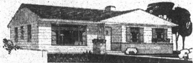
A SMALL HOUSE PLANNING BUREAU DESIGN NO. A-315