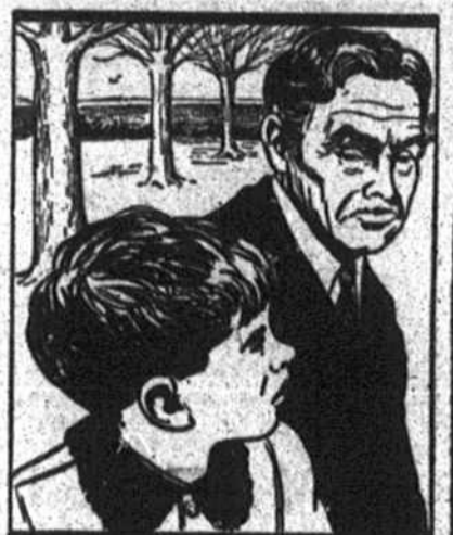
"Could you give it to me in new shiny dollars," Tommy said.

In the small sitting room Aunt Lucy and Uncle Pete were talking. Aunt Lucy insisted that two dollars was an awful lot to pay for a dog. They were poor people after all and could only afford to give Tommy sensible things. Uncle Pete thought Tommy should have the puppy he wanted. He was only seven, and needed a playmate.