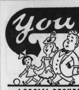
and SOCIAL SECURITY

A—They could get the waiver form from Internal Revenue or from our office. It is quite probable most of them would like to