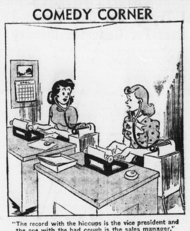
"The record with the hiccups is the vice president and the one with the bad cough is the sales manager."

Ladies' Hose ..... pair 39c GLAMALON SEAMLESS MESH MINI MEAL 3-1 1/2-Oz. CANS $1.00 MORGAN JONES Dish Cloths Pkg. of 3 — 49c Kitchen Terry 3 for $1.00 INDOOR - OUTDOOR Scuffs ..... $1.98 VALUE 89c GUARANTEED BY A&P 8-OZ. BOTTLE Bonesse Shampoo ..... 49c SUN GLO PINK LOTION Dish Detergent ..... 39c QT. BOTTLE