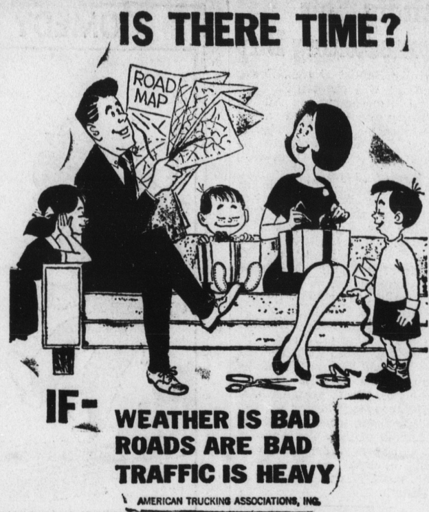
AMERICAN TRUCKING ASSOCIATION, INC.

Performance of the hand, or emergency brake, is important too. It should be able to hold the