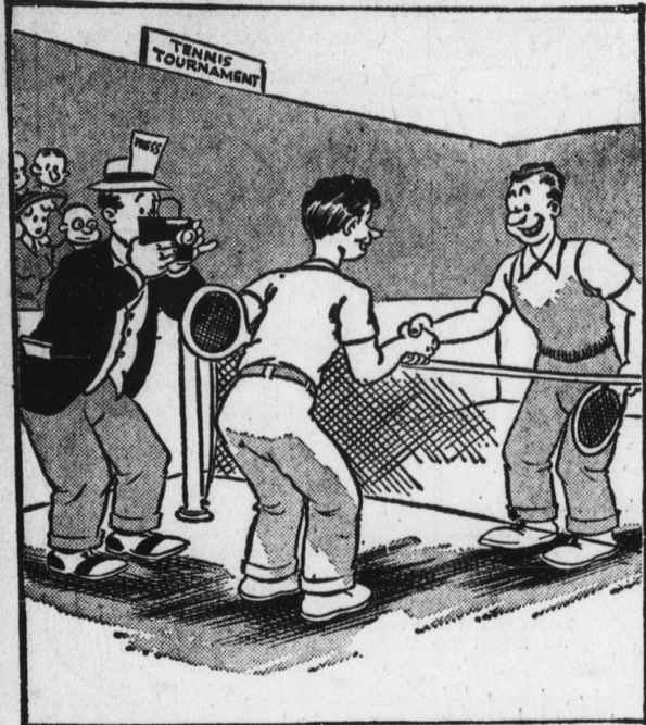
"If it wasn't for these newspaper cameras, I'd like to wrap this racket around that empty head of yours!"