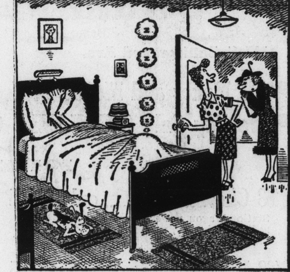
"It's a mania with him. He thinks all the rest of the world is wrong."