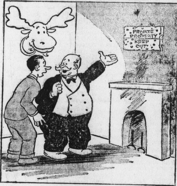
"I bagged that one last fall."