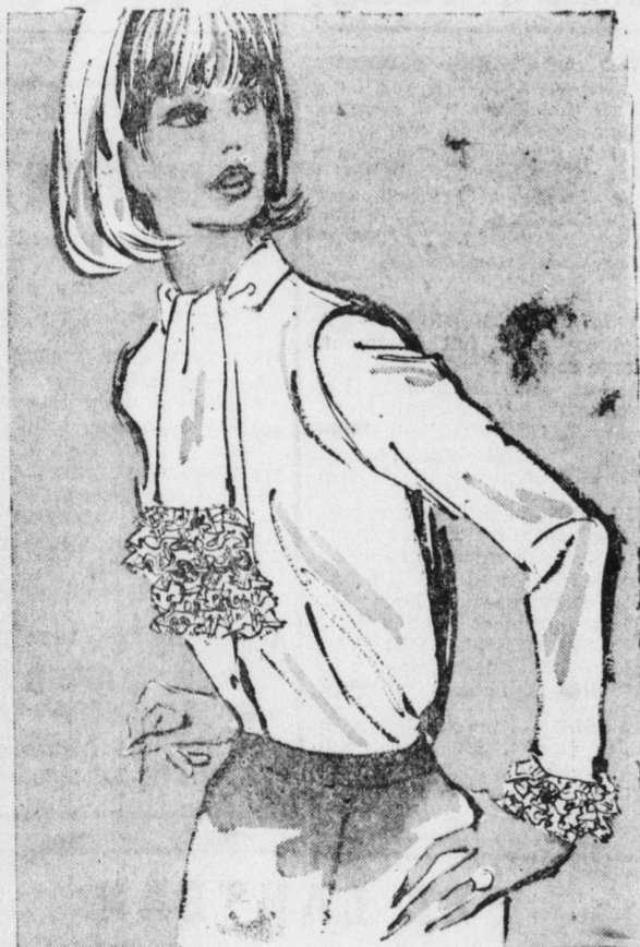
Multi-face banded Ascot-tied blouse.