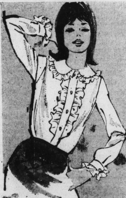
Illusion sleeve and platter collar blouse.