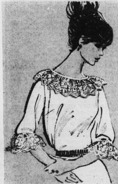
Lace-edged double-flounced blouse.