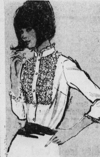
Wide "Dutch" shirred lace collar blouse.