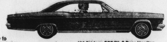
'66 Fairlane 500/XL 2-Door Hardtop