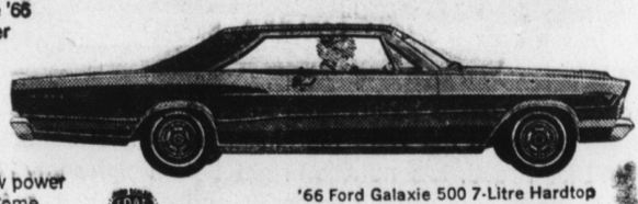
'66 Ford Galaxie 500 7-Litre Hardtop

Be the first on your highway to handle our scorching new 428-cubic-inch V-8... standard in the '66 Ford 7-Litre, one of six power options in '66 Galaxie 500/XL's. Be first to try our re-invented '66 Fairlane with the new optional 330-cubic-inch Thunderbird V-8. Hot new styling keeps pace with new power up and down our '66 line. Come take the wheel!