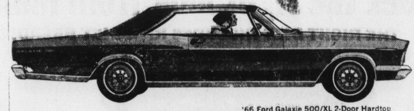
'66 Ford Galaxie 500/XL 2-Door Hardtop