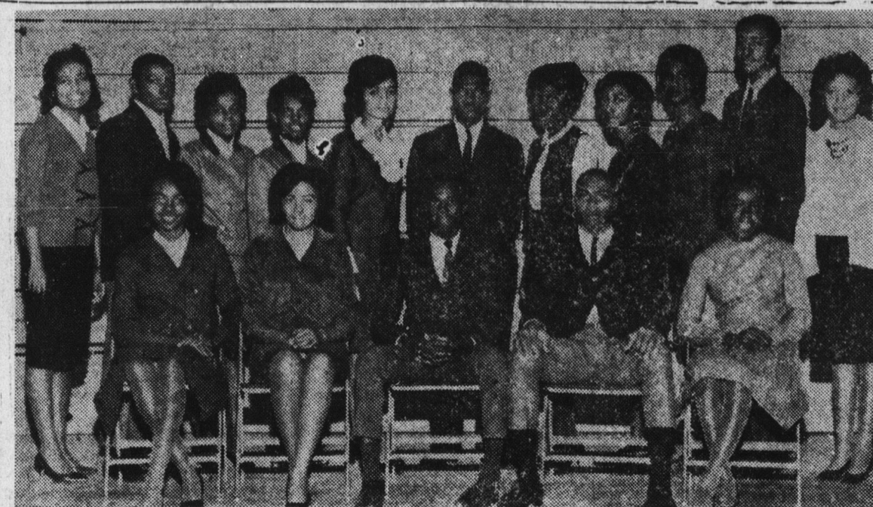
NATIONAL HONOR SOCIETY — Pictured above are members of the National Honor Society of Compact high school who were installed in recent ceremonies at the school.