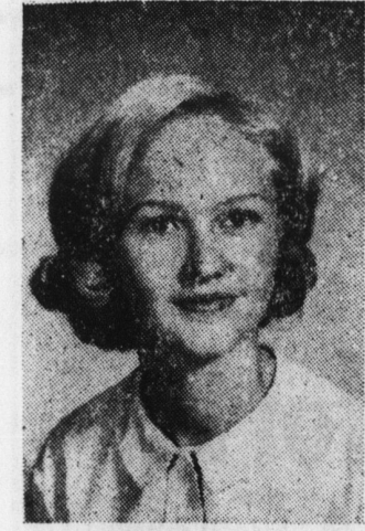
er of her pledge class.