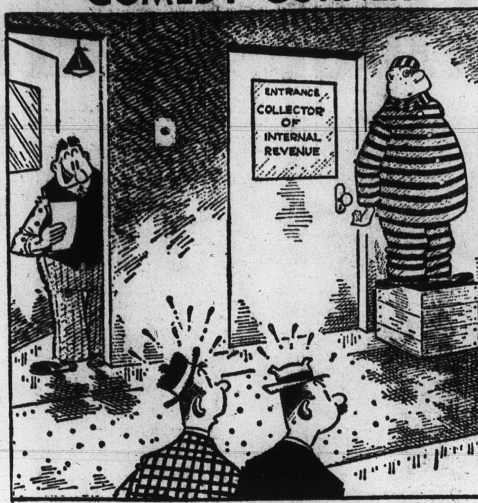
The reports are coming in more accurately since we put that dummy at the entrance!