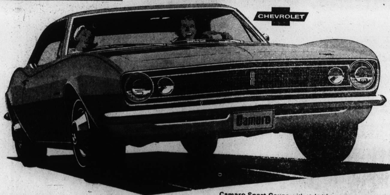
Camaro Sport Coupe with style trim group you can afford.

You've been waiting for a Chevrolet like this. Now it's here.