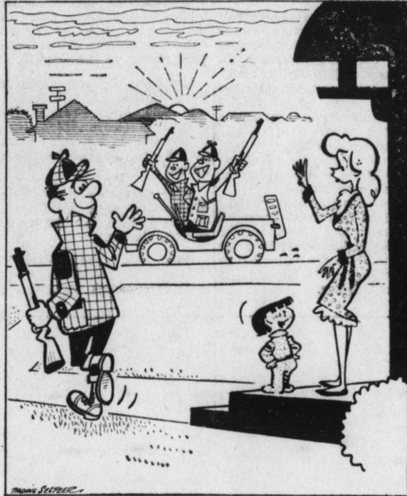
"Any other time, we couldn't pry him out of bed at this hour with a screwdriver!"