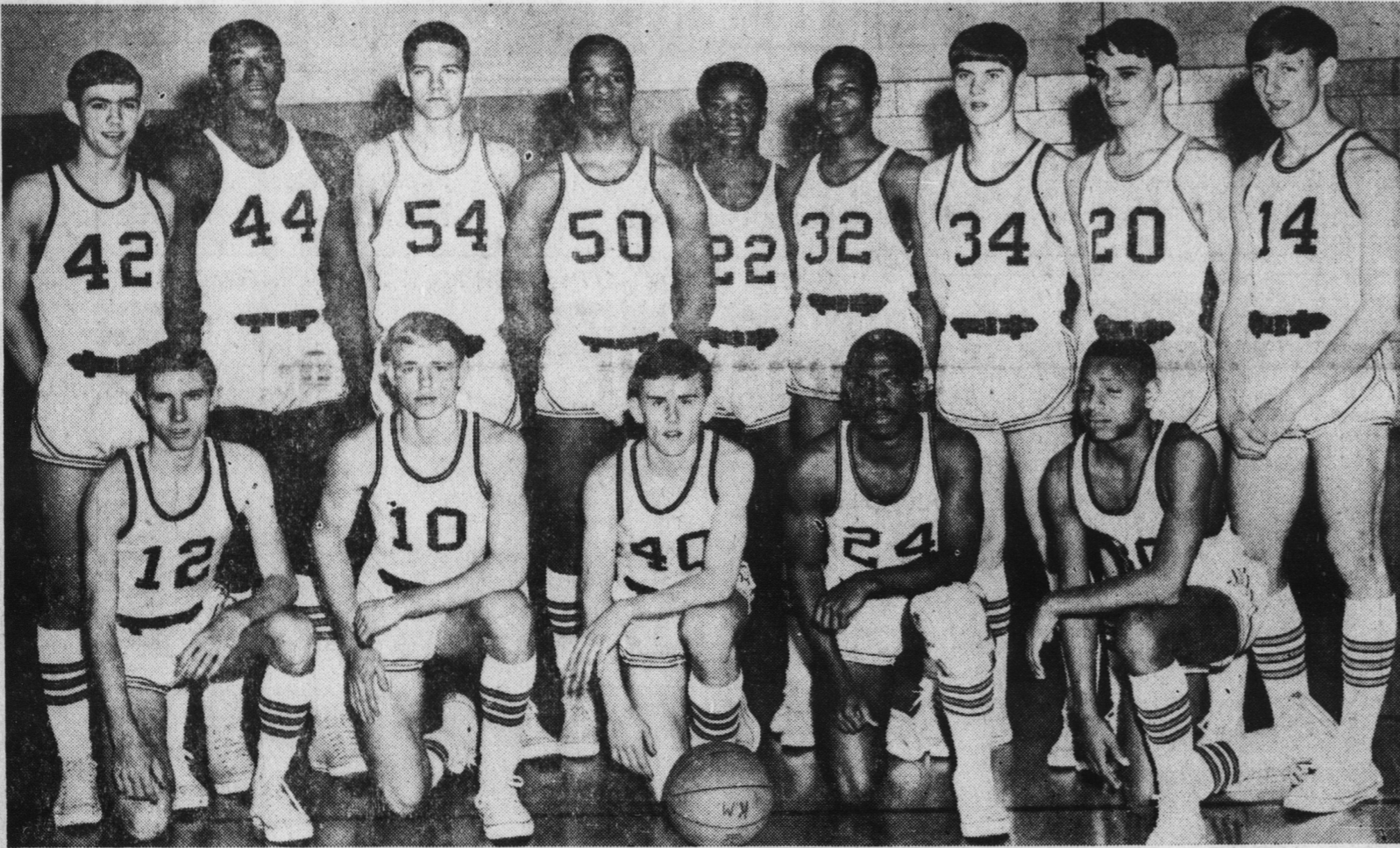
The 1968 Southwestern and Northwestern Bi-Conference Champions, 25-1.