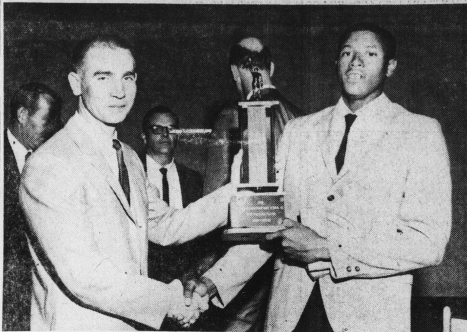
STUDENTS WIN MOST VALUABLE PLAYER AWARDS — The Kings Mountain Kiwanis club, at its annual basketball banquet Thursday, presented "Most Valuable Player" awards to two members of the Kings Mountain high school basketball teams.