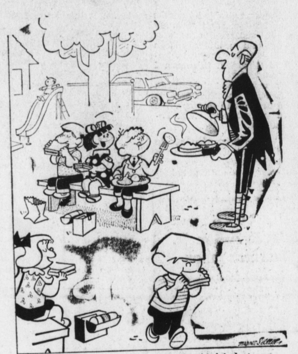
"Good ol' Ambrose Vanderhorn the third is just one of us kids!"