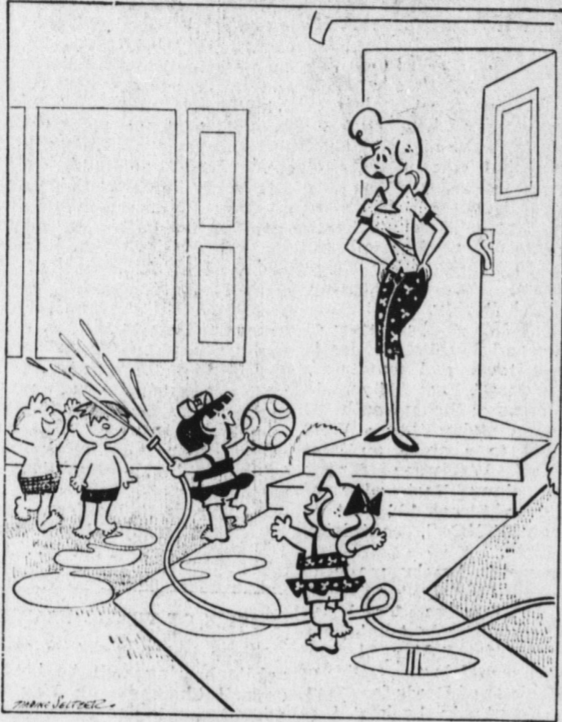
"What are you complaining about? The grass is getting WATERED, isn't it!"