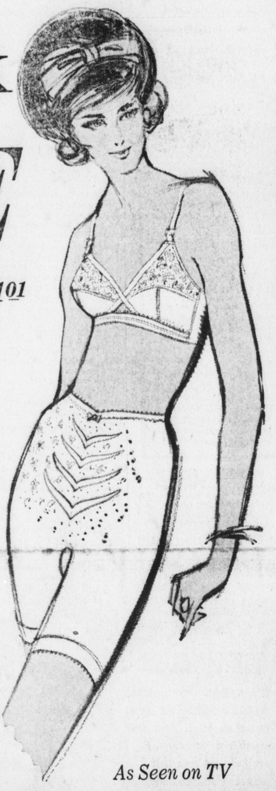
As Seen on TV