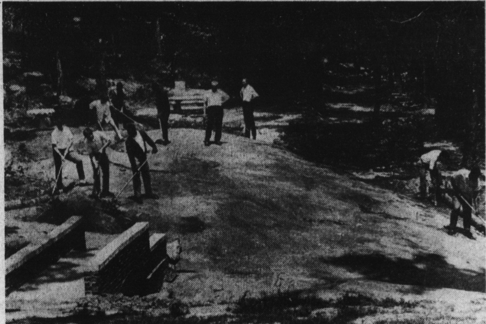
BEAUTIFICATION PROJECT AT FLAT ROCK—Kings Mountain high school agriculture students, under the direction of their three faculty advisors, have begun a project to beautify and develop the Flat Rock area from the road leading to John Gamble Memorial Stadium, Phifer road, to a beauty and recreation spot. Other students from clubs and organizations, the welding class and ornamental horticulture classes are joining in the effort.