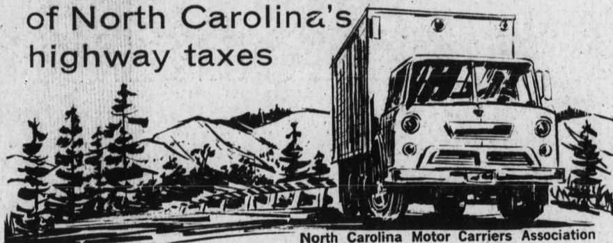
North Carolina Motor Carriers Association