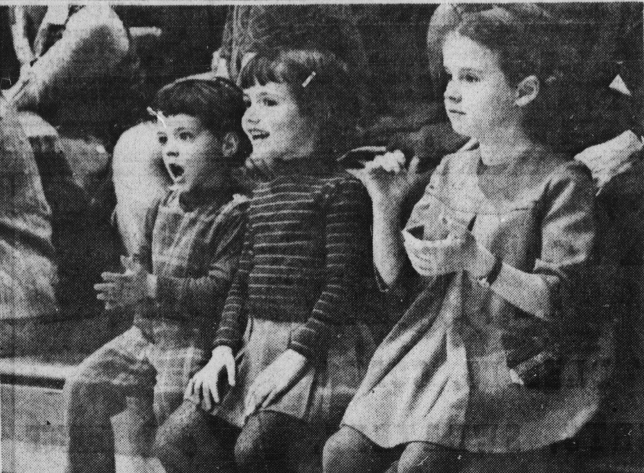
ATTA WAY TEAM — Three young Kings Mountain High basketball fans are enjoying what they're seeing. They were just part of a packed house that saw the Mountaineers take a 61-43 victory over county-rival Shelby at home Friday night. The KM girls also won, 32-21.