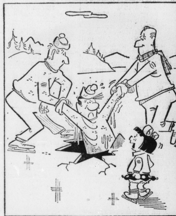
"Just teach me how to skate—I already know how to swim!"