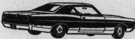
1969 FAIRLANE 2-DR HARDTOP