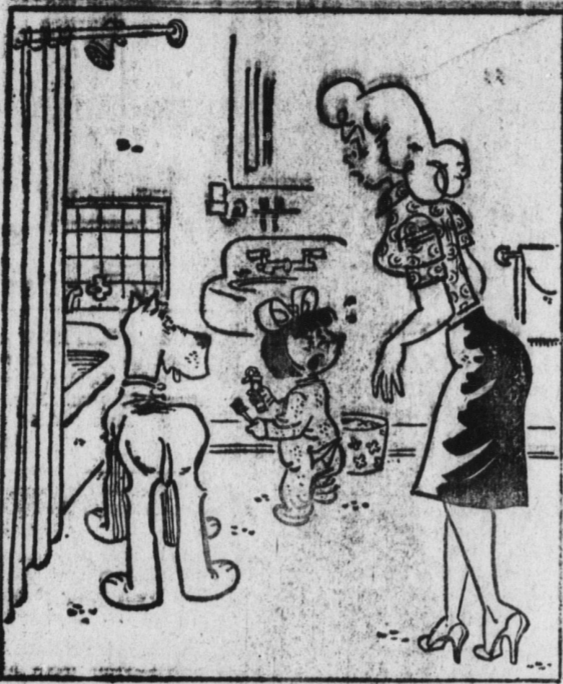
"Schultz has big bright teeth, but you don't see him brushing them every day!"