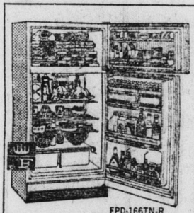
Frigidaire Frost-Proof with 154-lb. size freezer

Together they help prevent wrinkles—save ironing.