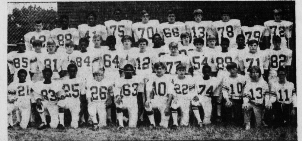
CENTRAL GRIDDERS — The Central Junior High Patriots, pictured above, ran their two year football record to 10-2 this year by sporting a 5-2 record.