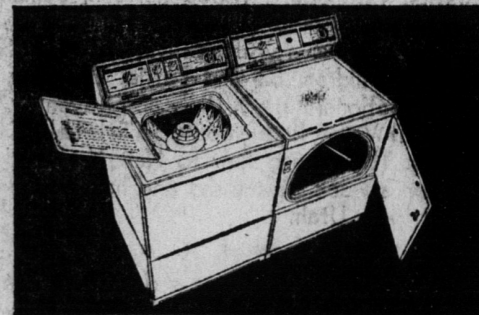
models WCDF and DCDF

Poppy brightens up the laundry, too. Pick this pair in any of the other Frigidaire colors as well.