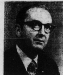
Jesse Helms FOR U. S. Senate

YES, I believe in Jesse Helms and I want to help elect him as our Citizen-Senator.