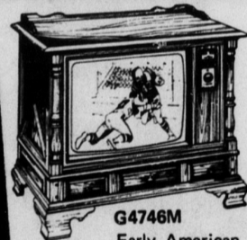
G4746M Early American