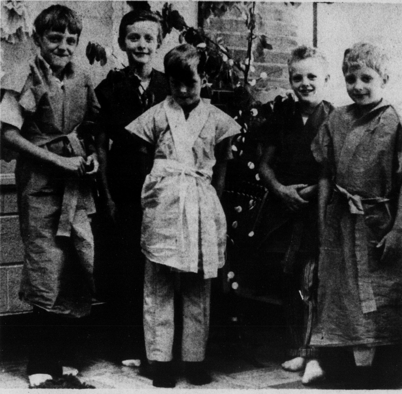
DECORATED CHERRY TREE -oft to right, Los Potnam, Gono Simp-