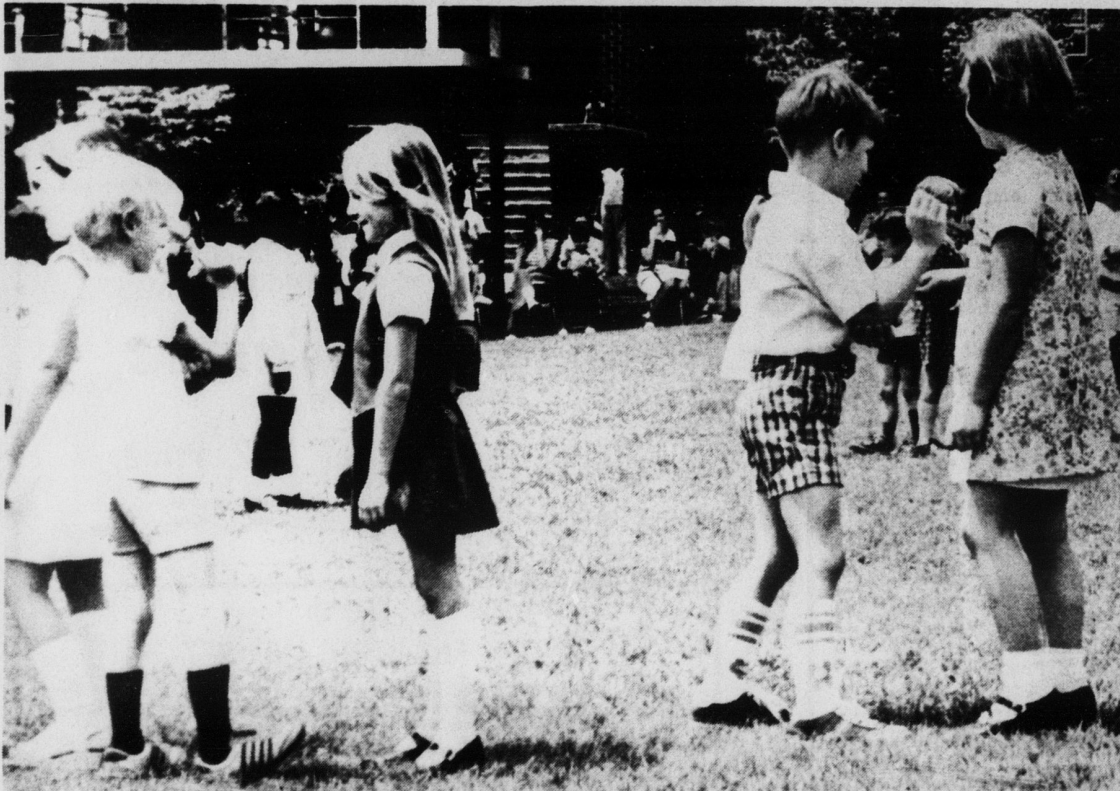
FIRST GRADE FOLK DANCERS — First Graders at East School dance as a part of traditional May Day festivities at East School.