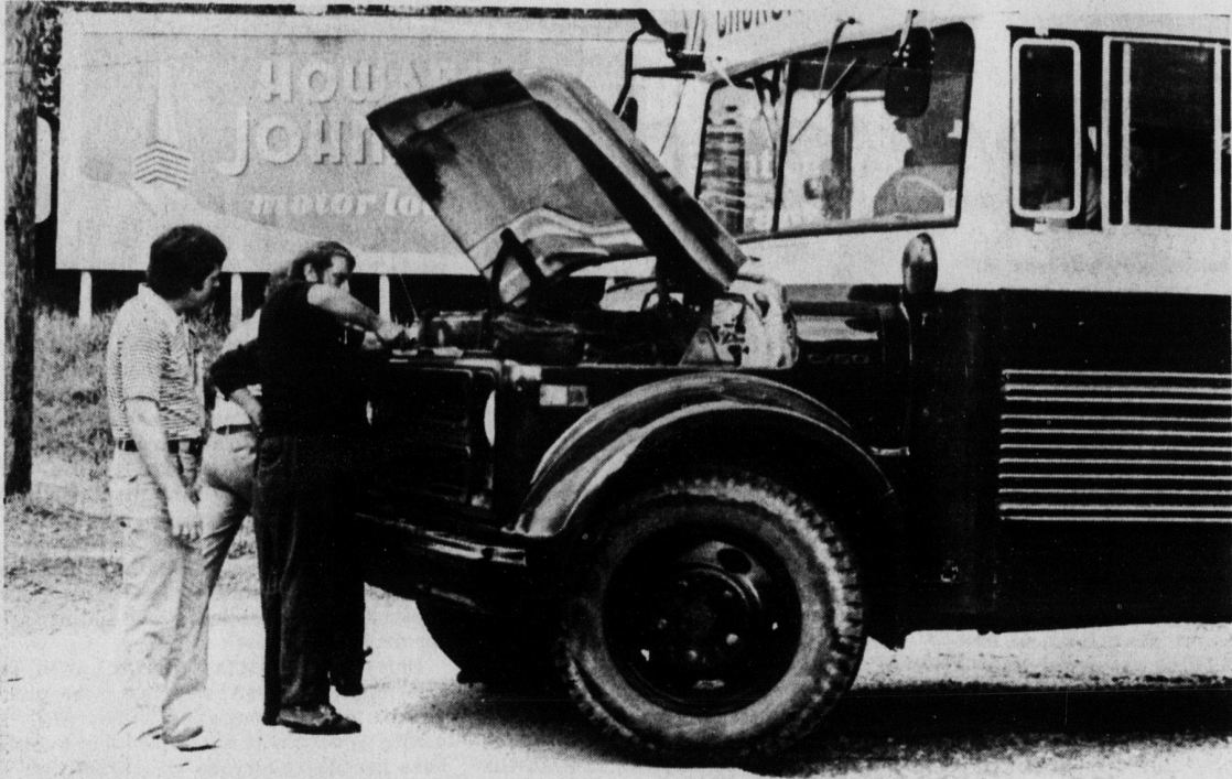
WOULD YOU BELIEVE BUS TROUBLE? — Pat Cheshire, left, Lyn Cheshire, back to camera, and a mechanic check the voltage regulator on the Presbyterian Church Bus during the youth group's visit to Colonial Williamsburg.