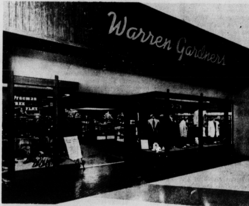
Warren Gardner's Exterior view shows modern, eye-appealing styling.