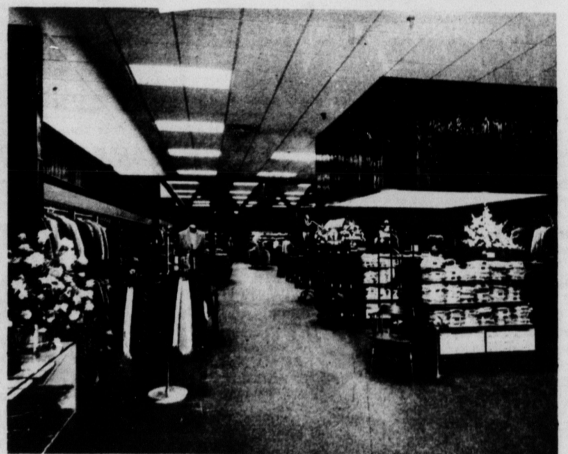
Interior photograph shows spacious facility with latest name brand merchandise.