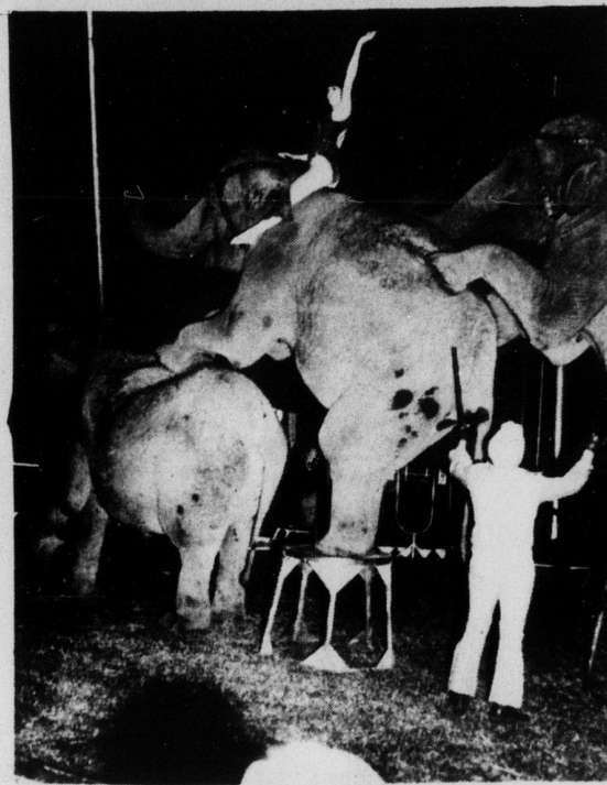
PERFORMING ELEPHANTS — Huge performing elephants are part of the exciting performances of Hoxie's Great American Circus coming to Kings Mountain Oct. 12th for two performances under sponsorship of KM Optimists for youth projects.

their fund raising to a menagerie has two greater extent. The educational One is Go-Go — the